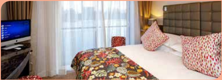
FRENCH BALCONY CABIN 155-170 SQ.FT.