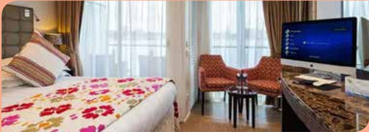
DOUBLE BALCONY CABIN 210-235 SQ.FT.