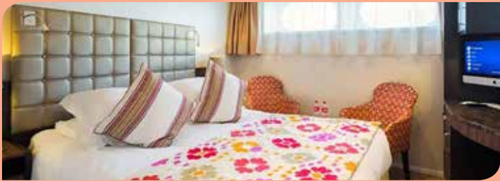
WINDOW CABIN 160 SQ.FT.