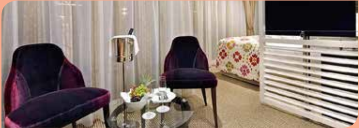
SUITE 350 SQ.FT.